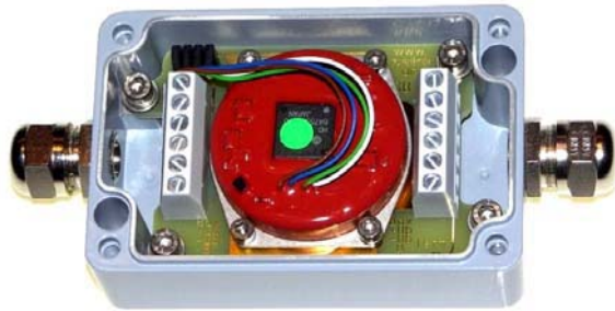
Sensor box containing one NG360 inclinometer with RS485 interface